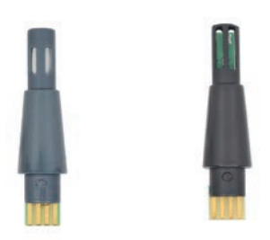
Hygrostick part number POL4750, for high moisture applications.