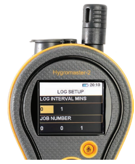
Set interval 1 minute to 24 hours