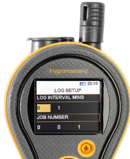
Set interval 1 minute to 24 hours